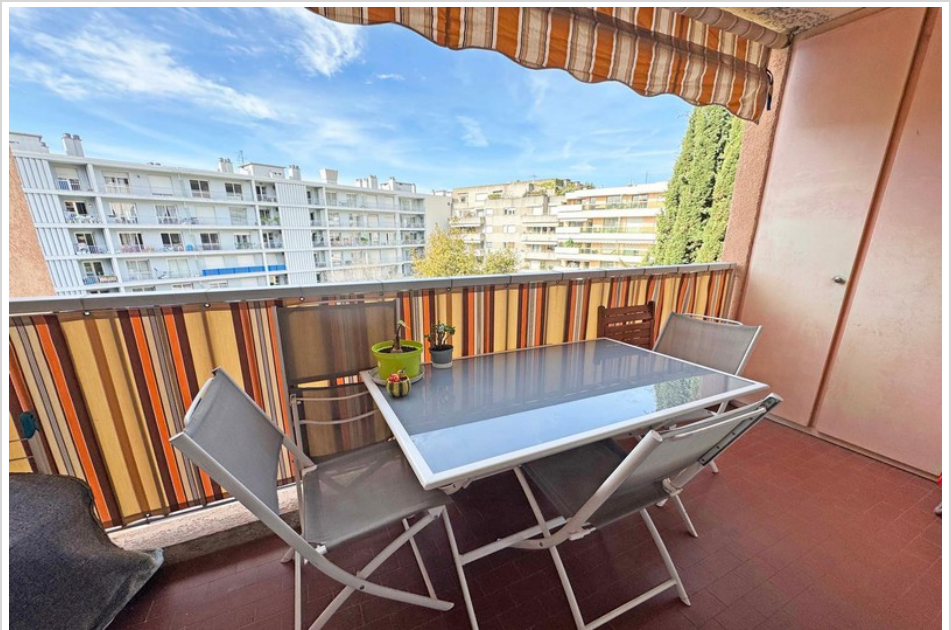
Apartment 3521 Vence