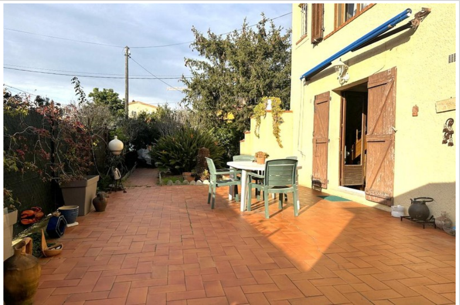
Bastide 235 Cagnes-sur-Mer